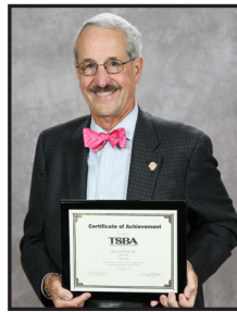
Keys Fillauer Oak Ridge